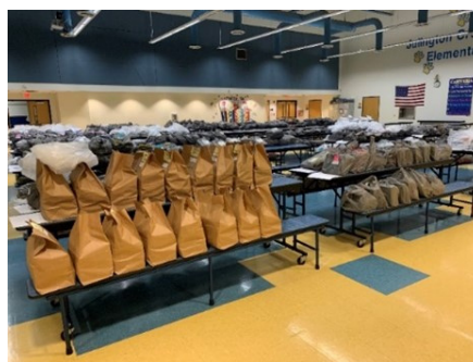
Packing Student Materials