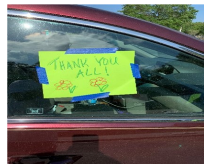
Love from our families!!