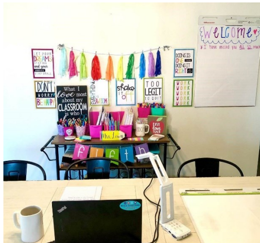
Teacher home set-up