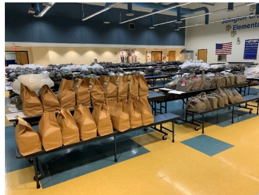
Packing Student Materials