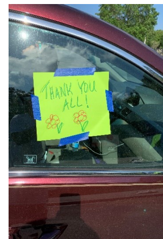
Love from our families!!!